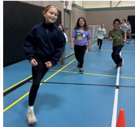
Grade 1 Land-based Learning; Grade 2 Easter Egg Hunt; Grade 2 Land-based Learning; Marafun Runners